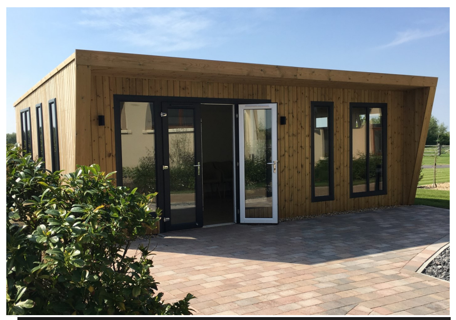
New waiting room, built in December 2016.